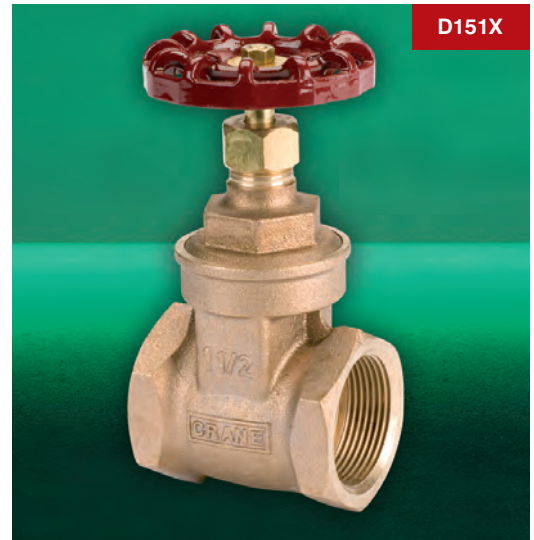
Please note the photograph denotes sizes 1/2" - 2" only.